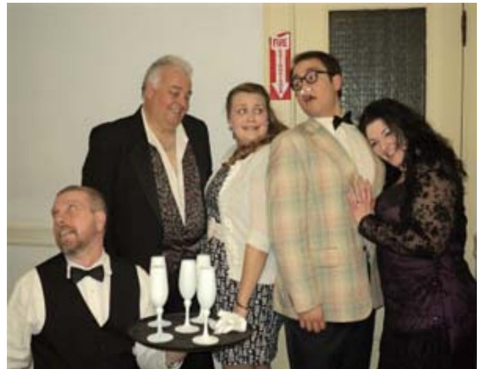
Cast of SUITEHEARTS , Majestic Theatre February production

Enjoy dinner and/or dessert with the Majestic Theatre company Apr. 27 - 29 when they present AN AMERICAN MILLIONAIRE , a murder mystery/comedy by Murray Schisgal, at the Chateau Function Facility, 203 Hanover St., Manchester, NH. Next at the same venue will be PUTTIN' ON THE RITZ , featuring the music and lyrics of Irving Berlin, May 18 - 20. Call (603) 669-7469.