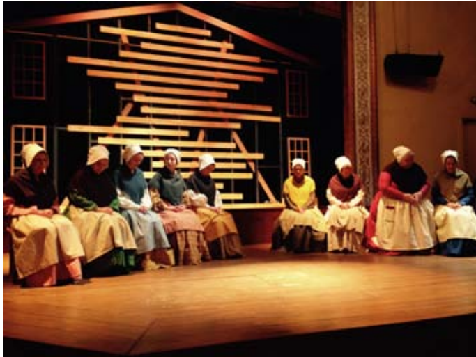
The Cast of AS IT IS IN HEAVEN , Everyman Repertory Theatre Feb/Mar. production