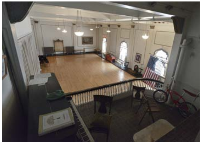
The Ballroom at Mechanics Hall Before Renovation