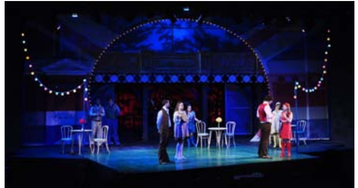
A Scene from LOVE'S LABOUR'S LOST , University of Maine at Orono February production