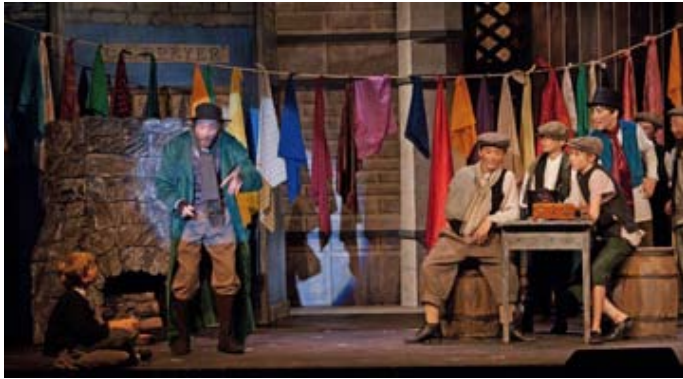
A Scene from OLIVER!, L/A Community Little Theatre October production.