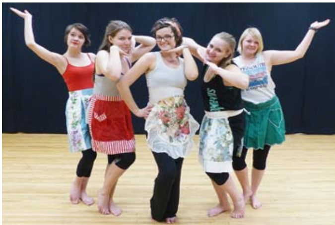
A Number from Dance USM! , University of Southern Maine