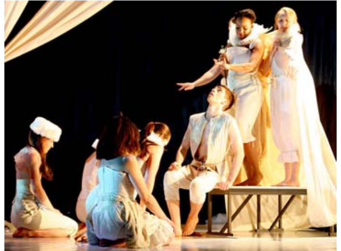
A Scene from ORLANDO , Colby College November production