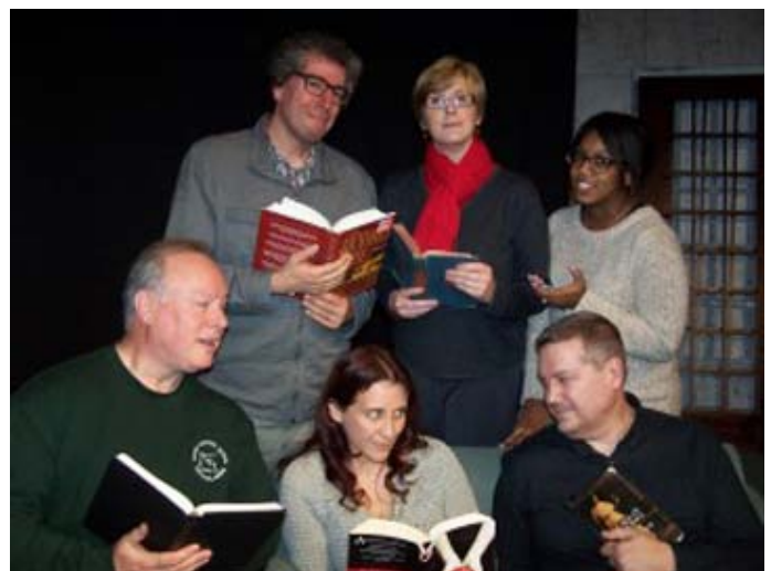
The Cast of THE BOOK CLUB PLAY, ACAT (Aqua City Actor’s Theatre) November production