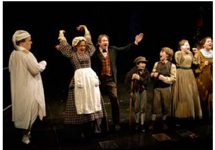
A CHRISTMAS CAROL, Portland Stage Company 2012: Scrooge sees the Cratchit family Christmas