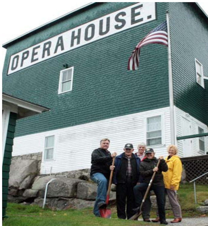
Stonington Opera House Arts Breaks Ground for New Scene Shop and Lobby, October 2014