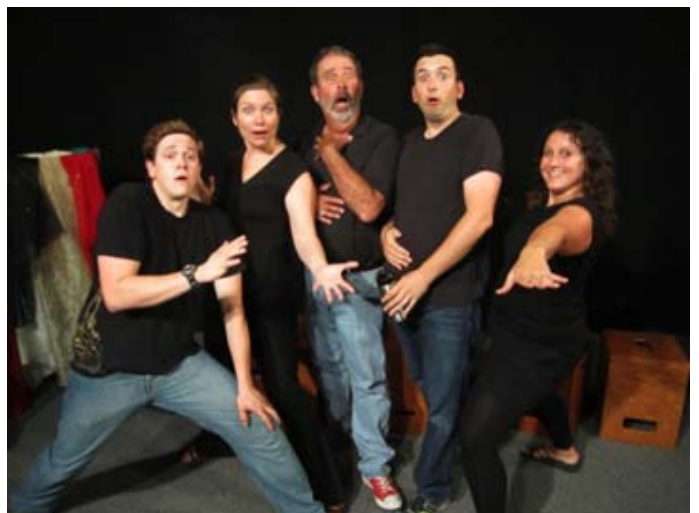
Portland Playback post performance