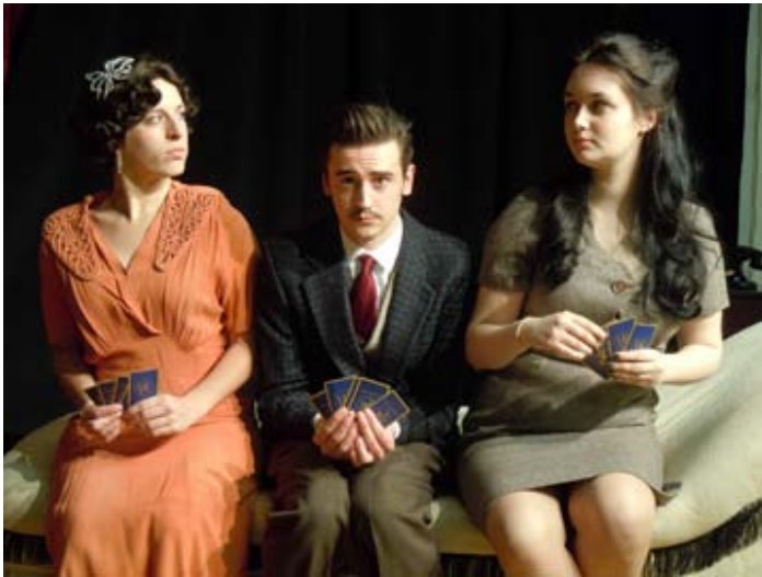
THE REAL INSPECTOR HOUND, Orono Community Theatre:

“That very much depends on the folks who like to come out and play with me. The core group of participants ebbs and flows, but there always has been enough interest to get through the next show.”