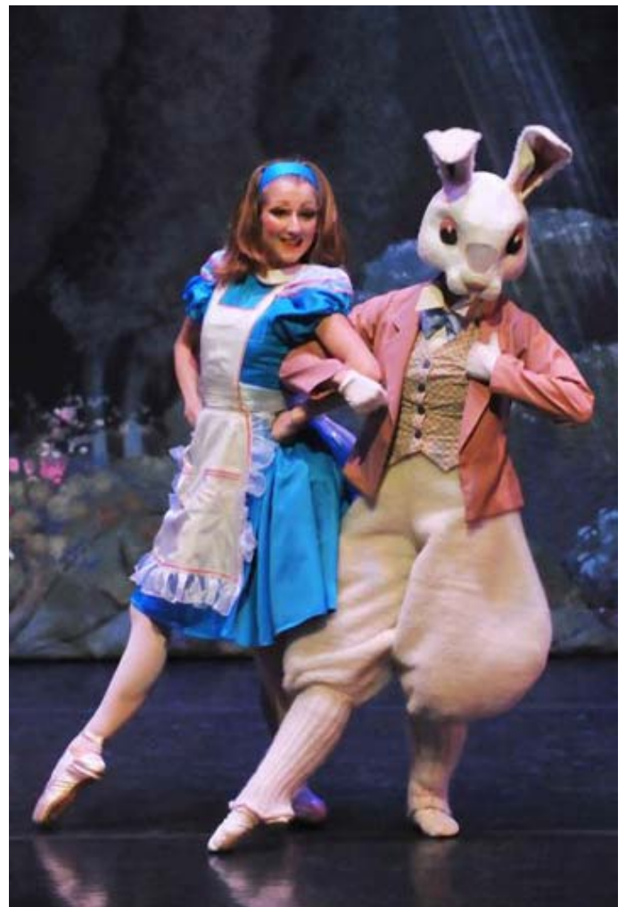
ALICE IN WONDERLAND, Maine State Ballet

The final screenings of the Metropolitan Opera Live in HD for the 2017-18 season are: COSI FAN TUTTE ("So do they all") by Mozart on Mar. 31 at 12:55 pm; LUISA MILLER by Verdi on Apr. 14 at 12:30 pm; and CENDRILLON (Cinderella) by Massenet on Apr. 28 at 12:55 pm. Here is the contact information for venues offering this series ( be sure to check with your local venue for the times and also because some will have changes in dates in order to fit in with their other scheduled events ): The Grand , Ellsworth, ME, www.grandonline.org , (207) 667-9500; The Strand , Rockland, ME, (207) 594-0070, www.rocklandstrand.com ; Brunswick 10 Cinema , Cook's Corner, Brunswick, ME, (207) 798-4505; Lincoln Theater , Damariscotta, ME, (207) 563-3434, www.atthelincoln.org ; Collins Center for the Arts , Orono, ME, (207) 581-1755, www.collinscenterforthearts.com ; Eastman Performing Arts Center , Fryeburg, ME, (207) 935-9232, www.fryeburgacademy.org ; Waterville Opera House , 1 Common St., Waterville, ME, (207) 873-7000, www.operahouse.org ; Capitol Center for the Arts , Concord, NH, www.ccanh.com , (603) 225-1111; The Music Hall , Portsmouth, NH, www.themusic hall.org , (603) 436-2400.