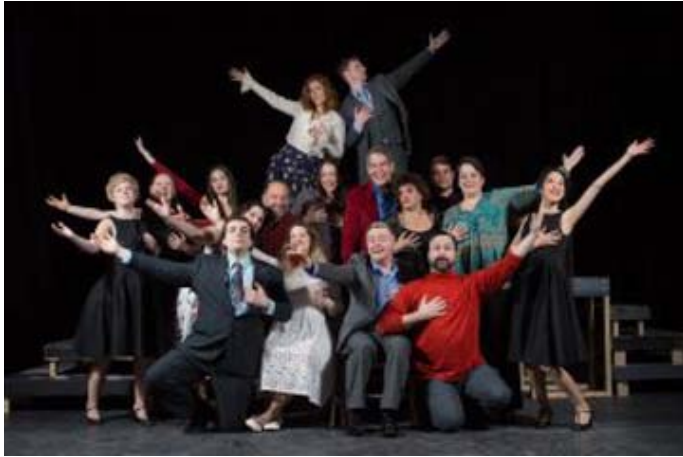
The Cast of COMPANY , Biddeford City Theater March production