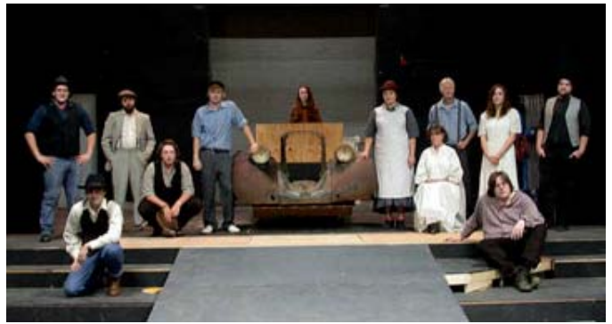
Cast of THE GRAPES OF WRATH , U Maine Farmington October production.