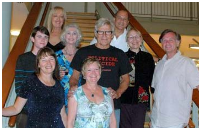
Cast and directors of POLITICAL SUICIDE with Playwright Ernest Thompson (center), River Company October production

production on Oct. 28 in order to get it in before the election, since it promotes Rock The Vote , a program to encourage young people to register and vote. However, Hurricane Sandy made it necessary to postpone that performance.