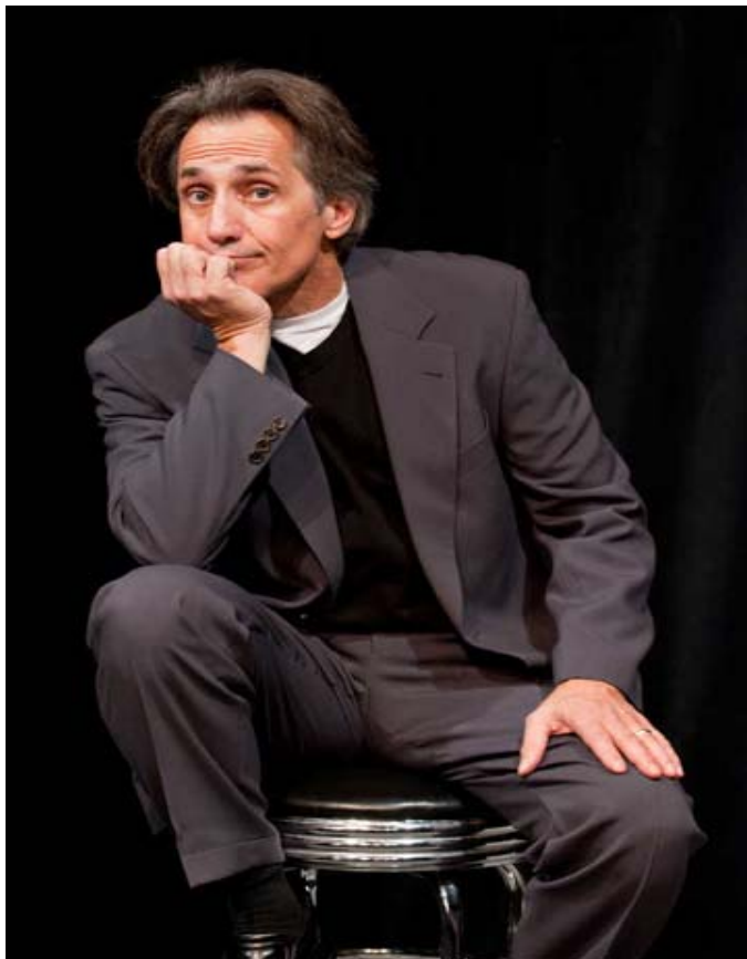
THE MALE INTELLECT: AN OXYMORON, The Public Theatre November production: Robert Dubac