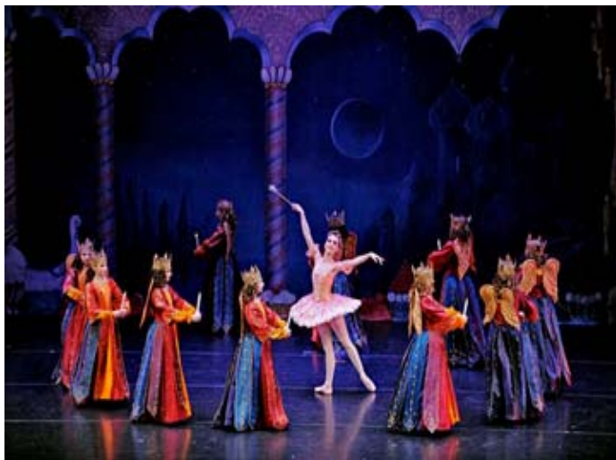
Scene from THE NUTCRACKER, Maine State Ballet .