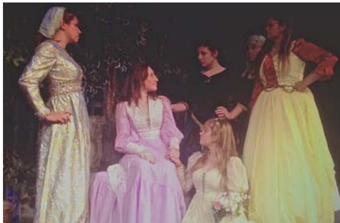
WHEN SHAKESPEARE'S LADIES MEET, Stonington's Opera House Arts Shakespeare Immersion Program in the Schools , Reach Performing Arts Center, November