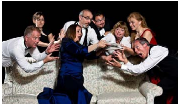
The Cast of RUMORS , Biddeford City Theater Oct/Nov. production

Also running Jan. 24 – Feb. 2 is GUNMETAL BLUES ("a hardboiled detective tale disguised as a lounge act – or the other way around?") as staged by City Theater , 205 Main St., Biddeford, ME, Fri. & Sat. at 7:30, Sun. at 2. Call (207) 282-0849 or visit www.citytheater.org .