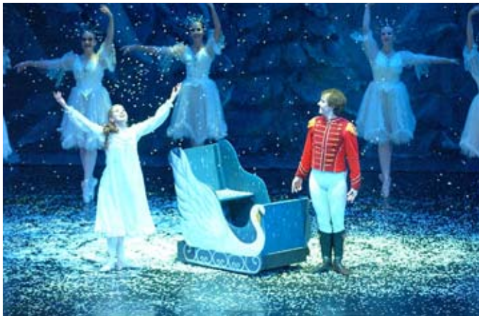
A Scene from THE NUTCRACKER , Maine State Ballet