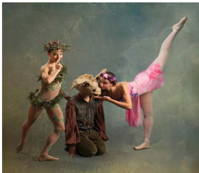
TITANIA'S DREAM, Bangor Ballet/Penobscot Theatre November Interdisciplinary Workshop & Performance on A MIDSUMMER NIGHT'S DREAM

WATERVILLE OPERA HOUSE & ARTSPACE , 93 Main St., 3 rd floor, Waterville, ME. Classes in dance, plus theater camps during summer. FMI call (207) 873-5381.