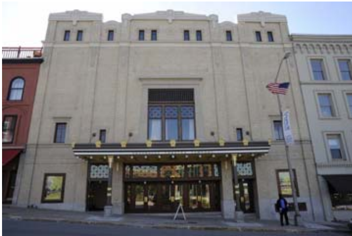
Penobscot Theatre Company at the Bangor Opera House

This started out as an article offering congratulations to those theaters that have stayed in business for 40 years, but after some research on the internet, I've decided to include all those Maine theaters that have managed to stay active that long and longer, even through economic downturns.