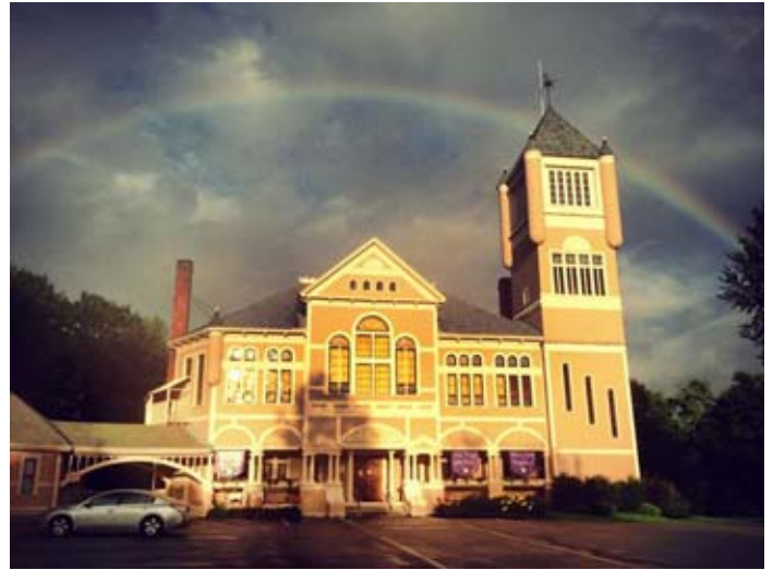
The Theater at Monmouth at Cumston Hall

getting the participants back to school or into a lasting job. NST continues to offer diverse plays and a musical from spring to fall as well as sometimes a radio show at other times of the year and, of course, the school. www.newsurrytheatre.org