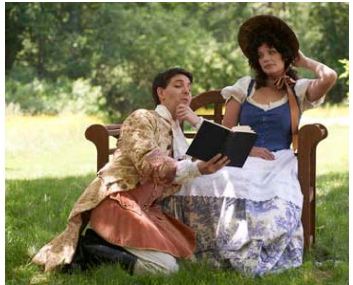
A Scene from PATIENCE, Theater at Monmouth September production.

Camden Civic Theater of Camden, ME, has ventured out of its home space for rehearsals and subsequent performances of THE MIRACLE WORKER, the story of Helen Keller and Annie Sullivan, at Northport