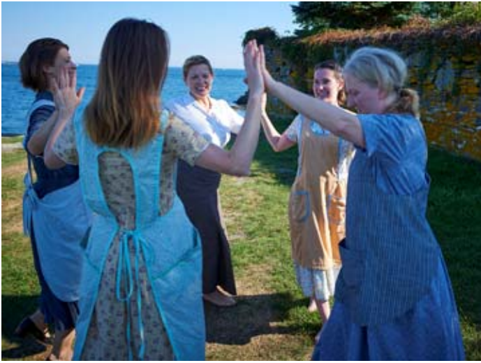
DANCING AT LUGHNASA, Portland Stage Company: The Mundy Sisters