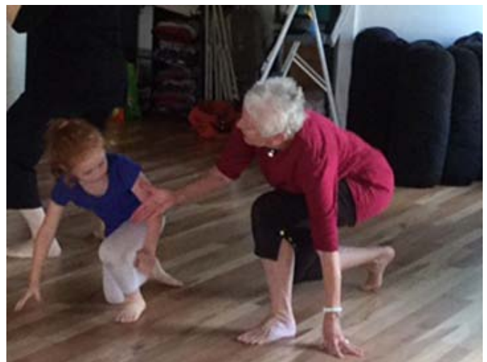
Commemorating THE TWENTY in Dance (rehearsal photo)