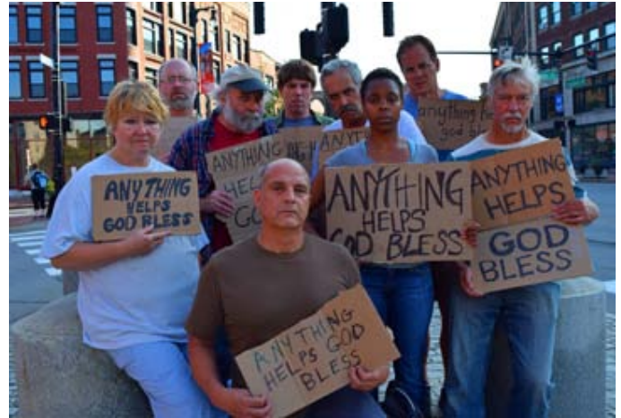
ANYTHING HELPS GOD BLESS, Snowlion Repertory Company

3 at Portland Ballet Studio Theater at 7:30 pm. Call (207) 518-9305 or visit www.snowlionrep.org .