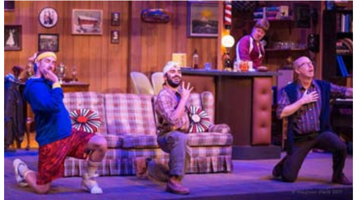
Cast of THE FABULOUS LIPITONES, Penobscot Theatre Company September production